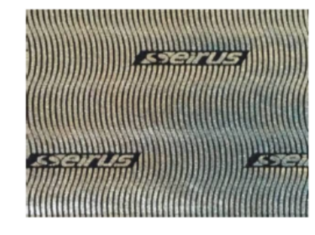
'093 patented design