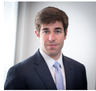
William H. Milliken